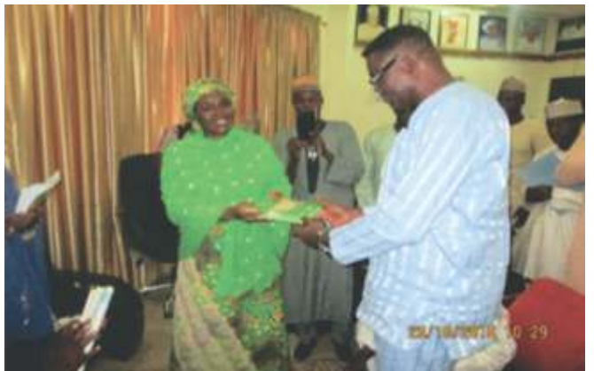
One of the Accreditation Panel Members Donating Books to the University Library