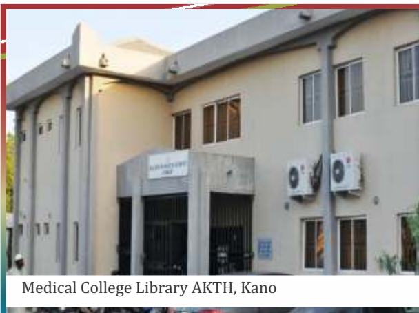
Medical College Library AKTH, Kano