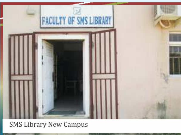
SMS Library New Campus