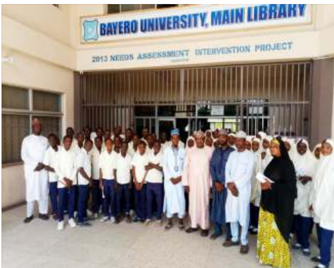
Staff and students of the Tarbiyya Academy visited the University Library

Some staff and students of Tarbiyya Community College Hoto, Kano visited the University Library on Thursday 15 th November, 2018. The University Librarian formally received them as they also went round the departments of the Main Library to observe their resources and services.