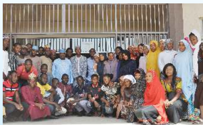
The SIWES programme participants in a group picture with the University Librarian and other Library staff

During the quarter, the University Library organized send forth event for the Students Industrial Work Experience Scheme (SIWES) participants who recently concluded their industrial training with the Library from Department of Library and Information Sciences of the University. The occasion took place in the University Library's PG/Staff Computer Cafe on 28th November, 2018. In his remarks during the occasion, the University Librarian urged the students to acquire computer knowledge as it has become very imperative in the library and information services, and assured them that, the University Library is their second home, as they are always welcome.