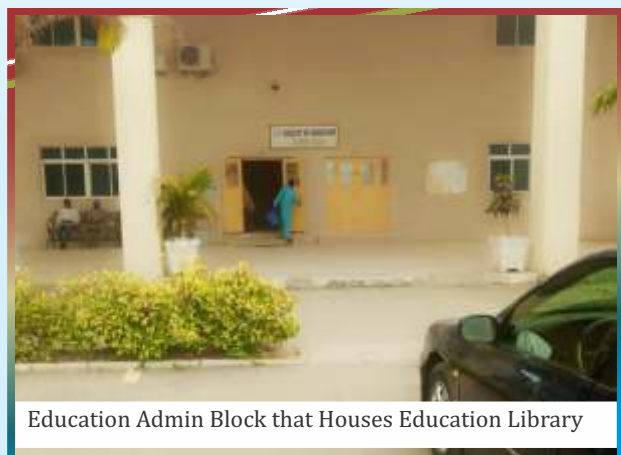
Education Admin Block that Houses Education Library