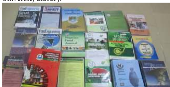
Newly acquired Local Journals Received by University Library

As equally approved by the Vice Chancellor 118 titles of 49 volumes of local journals on critical areas of need have been acquired and received by the University Library.