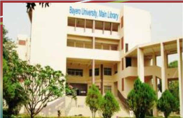
Front View of the University Main Library New