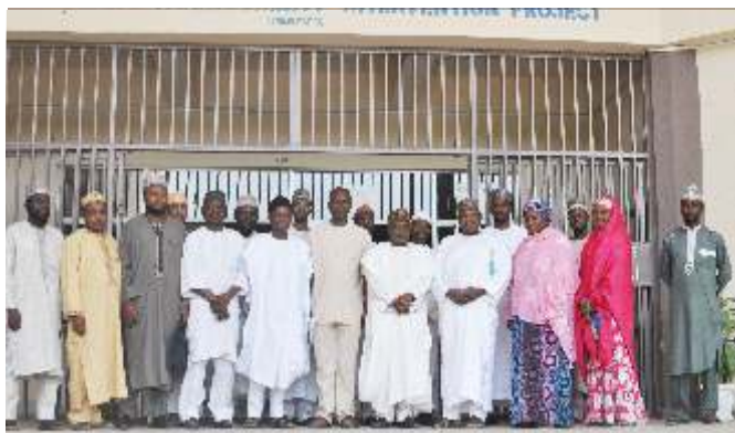
Chemical Engineering Accreditation Team