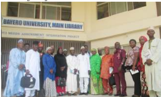
Food Science and Technology and Information and Media Studies Accreditation Teams in a group picture with University Library staff

All the teams have assessed and expressed satisfaction with available print and electronic information resources on the programmes.