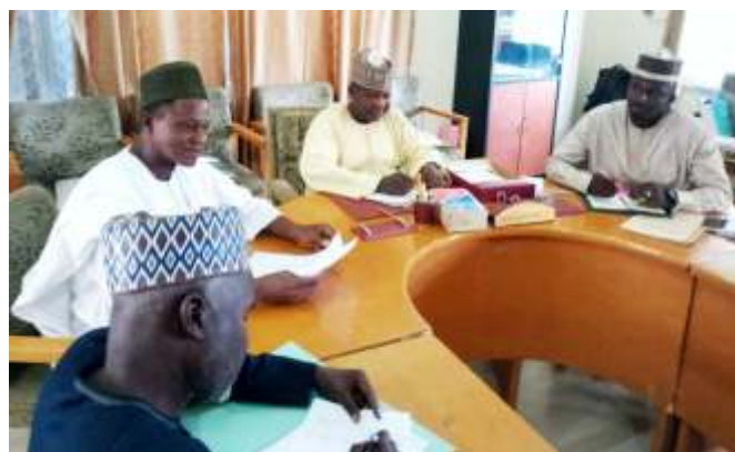
Members of Steering Committee Ado Bayero Forum for Historical Documentation and National Dialogue during their inaugural meeting at the Secretariat