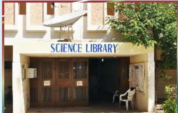
Science Library Old Campus