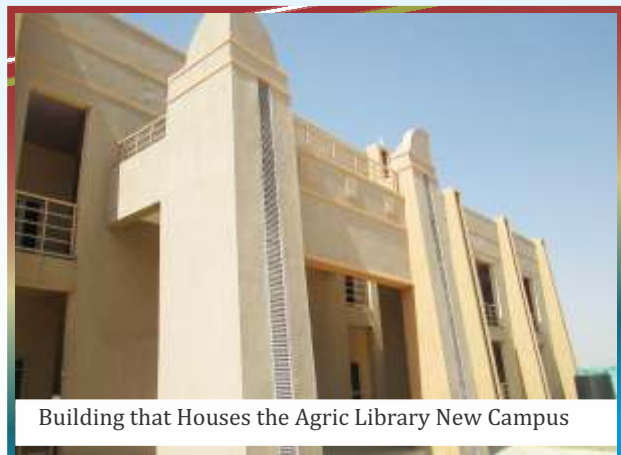
Building that Houses the Agric Library New Campus